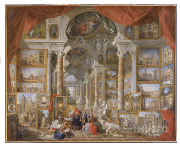
Galerie de Vues de la Rome Moderne, Panini (1759). What S.W.E.R.C. had in mind when he tried to merge his paintings.

That's when he received an unexpected phone call: a client saw a photograph of one of his paintings and is willing to buy it now! He had forgotten to tell the art gallery to remove his old works from the catalog! He